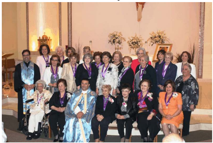
Members of the Altar Society - St. Anne's Club at St. Maron Church in Minneapolis, Minn.