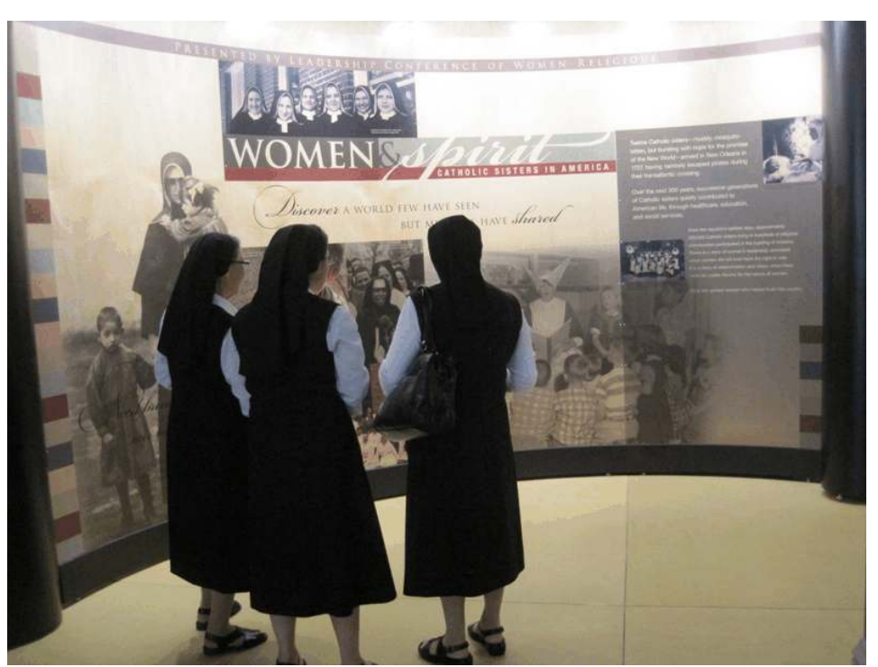
Antonine Sisters at the Exhibit.