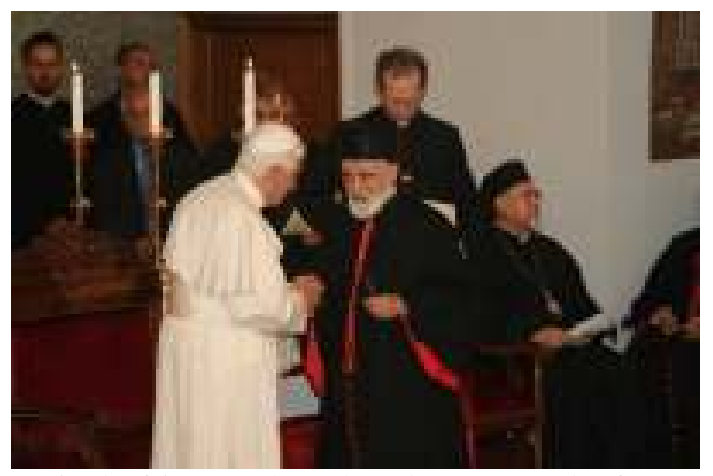
Patriarch Sfeir greets the Holy Father at Our Lady of Grace Maronite Cathedral in Larnaca, Cyprus.

n June 6, 2010, at 4.30 p.m. the Holy Father visited the Maronite Cathedral of Cyprus, which is dedicated to Our Lady of Grace. The cathedral, consecrated in 1960, was built with funds collected from the faithful and a donation from the Cypriot government.