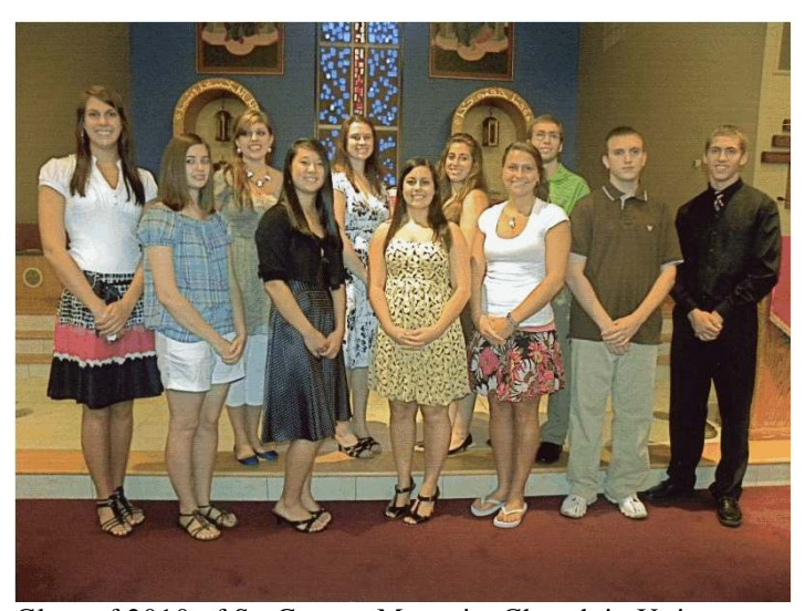
Class of 2010 of St. George Maronite Church in Uniontown, Penn.