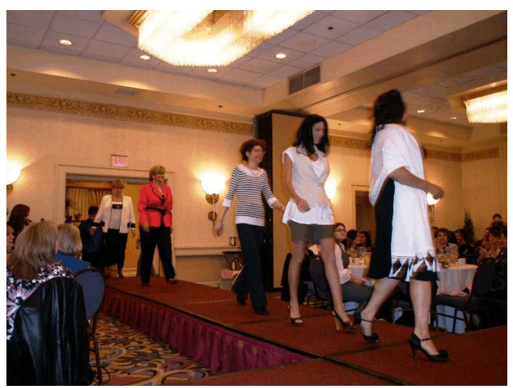
All of the Models on the runway for the closing ceremony.