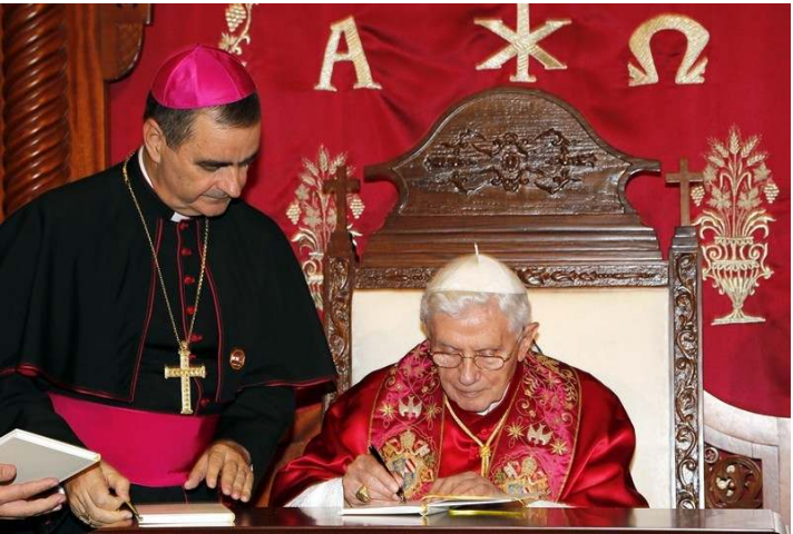
Pope Benedict XVI signs the Post-Synodal Apostolic Exhortation.

The evening of September 14, 2012, Pope Benedict XVI signed the Post-Synodal Apostolic Exhortation of the Special Assembly for the Middle East of the Synod of Bishops, "Ecclesia in Medio Oriente" in the Greek-Melkite Basilica of St. Paul in Harissa , Lebanon. The basilica forms part of a complex which includes a major seminary and a "house for writers" who study the sacred texts and translate documents of the Magisterium into Arabic. Since 1909 it has also been the headquarters of the Missionaries of St. Paul.