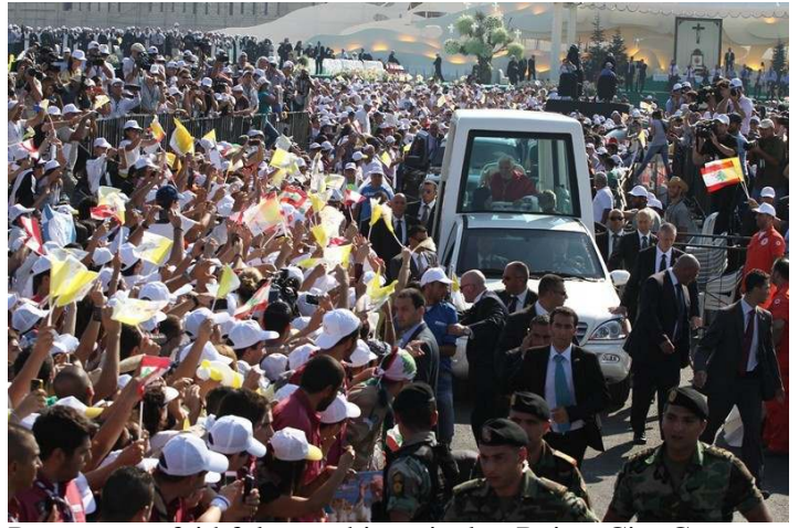
Pope greets faithful upon his arrival at Beirut City Center to celebrate the Mass.

Pope Benedict XVI then turned his attention to the second reading, in which St. James states that, if our adherence to Jesus is to be authentic, it requires "concrete actions. ... It is an imperative task of the Church to serve and of Christians to be true servants in the image of Jesus," he