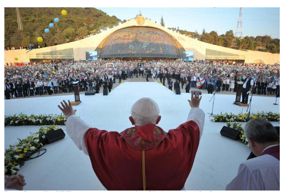
troubled times and their faith was the Pope Benedict XVI greets young people of Lebanon in Bkerke.

"The frustrations of the present moment must not lead